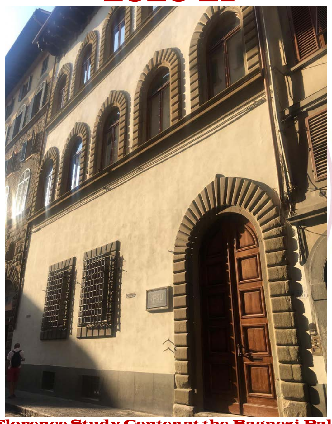
FSU Florence Study Center at the Bagnesi Palace